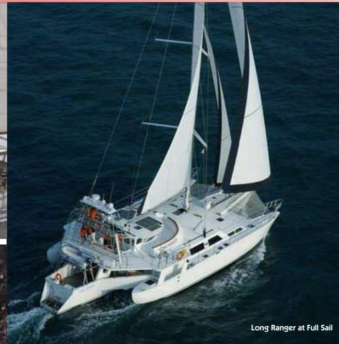
Long Ranger at Full Sail