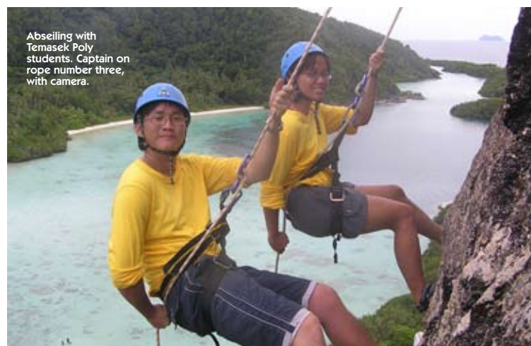
Absailing with Temasek Poly students. Captain on rope number three, with camera.