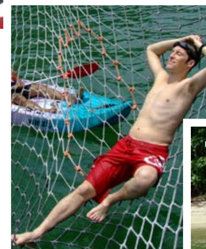
A break from kayaking