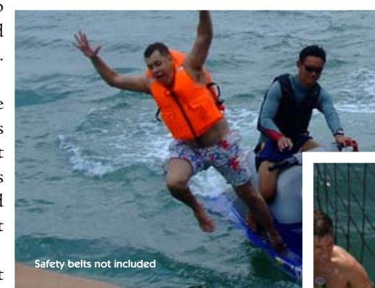
Safety belts not included