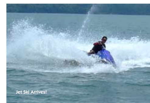
Jet Ski Arrives!