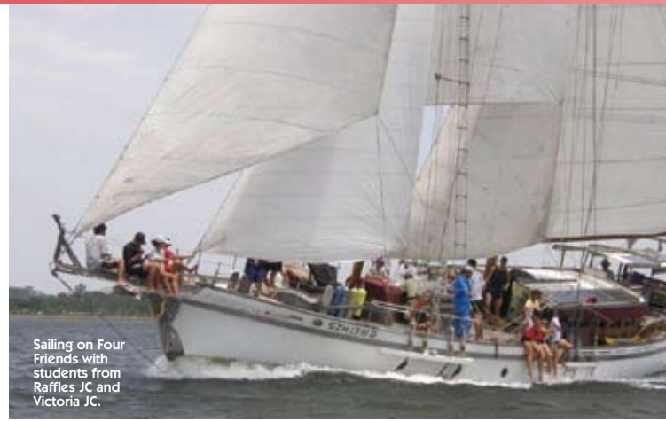
Sailing on Four Friends with students from Raffles JC and Victoria JC.