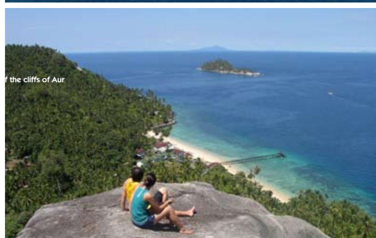
of the cliffs of Aur