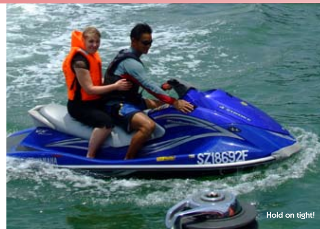
Hold on tight!

While cruising, I thought to myself that it would be really nice to have a family gathering on board. And when you have a big family like