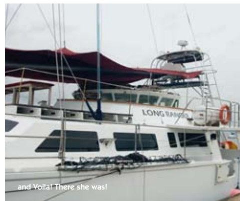
and Voila! There she was!