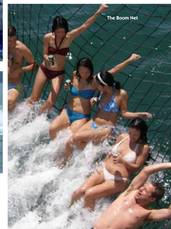
The Boom Net