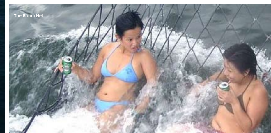
The Boom Net