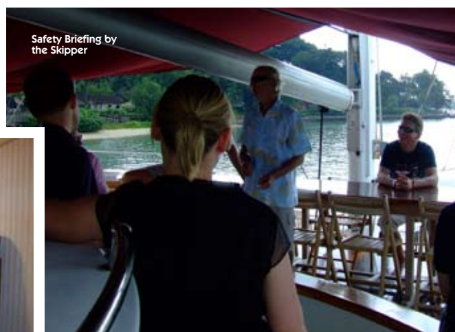
Safety Briefing by the Skipper