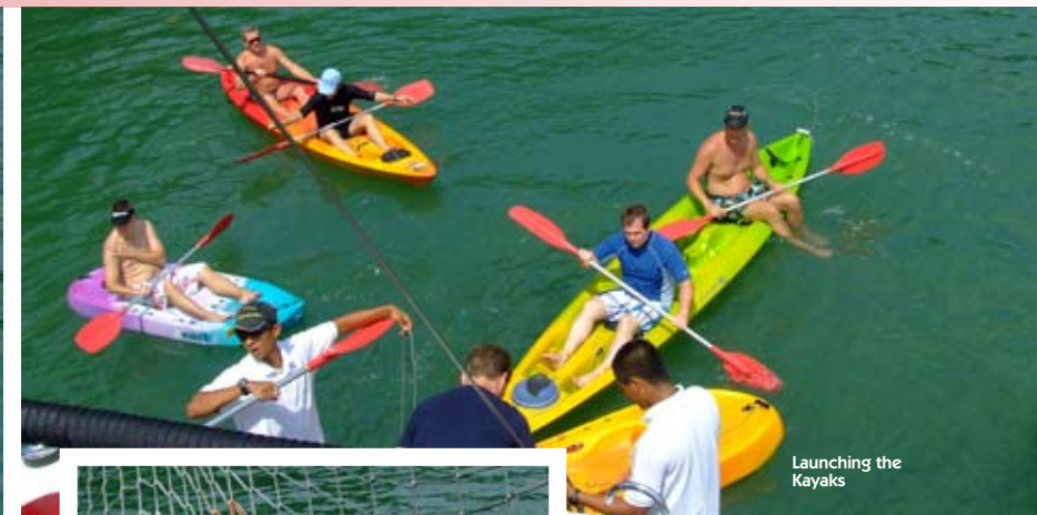
Launching the Kayaks