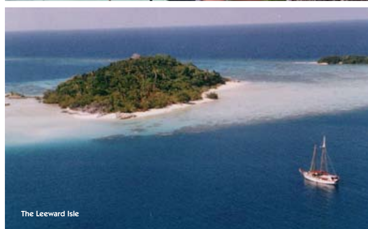
The Leeward Isle